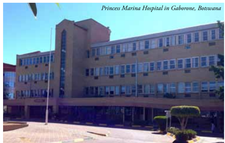
Princess Marina Hospital in Gaborone, Botswana

communities are held on a rotating weekly basis. Botswana has one of the highest HIV/AIDS infection rates in the world, with approximately one quarter of the population infected. Many patients I encountered had cutaneous manifestations of HIV. These dermatoses included Kaposi's sarcoma, HIV related photosensitivity and pruritus, HIV related epidermodyplasia verruciformis, as well as concurrent opportunistic infections. However, common things being common – atopic dermatitis, lichen planus, psoriasis, acne vulgaris, and cutaneous lupus were a major part of the daily patient load. Some of my more interesting patients included a few patients with Stevens Johnson Syndrome, erythrodermic pemphigus, subcutaneous panniculitis-like T cell lymphoma mimicking dermatomyositis, and verrucous secondary syphilis. Any biopsies that were performed were processed at the local pathology laboratory, and read remotely via a telepathology system by Carrie Kovarik, M.D.