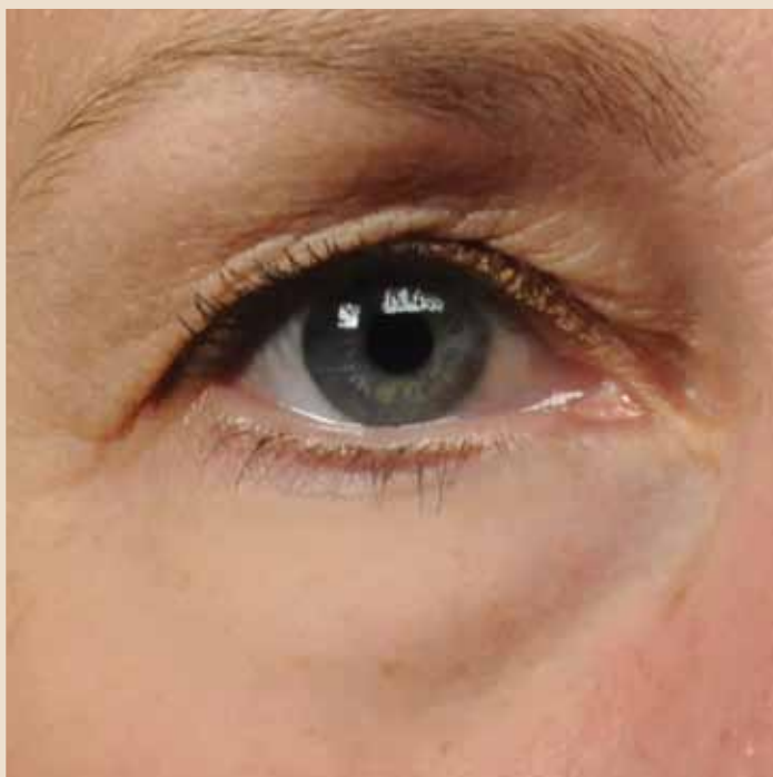
Hour 4 1,*