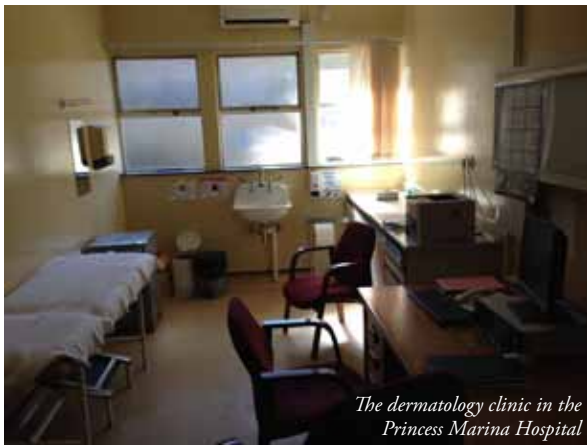
The dermatology clinic in the Princess Marina Hospital